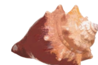
FLORIDA FIGHTING CONCH