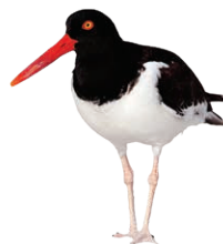
AMERICAN OYSTER CATCHER